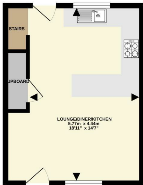
GROUND FLOOR 25.6 sq.m. (276 sq.ft.) approx.